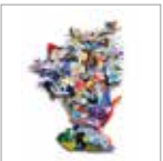
Cover Takayoshi Ueda (Japan) Fertile Island 1 63 x 48 cm Collage of hand-painted material of hard paper 2014

Presenting a selection of the best entries from the shortlisted candidates of the 2016 International Emerging Artist Award.